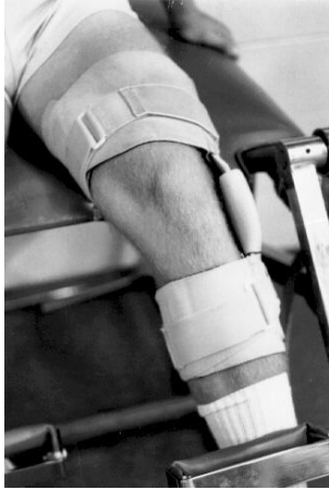
Fig 9. The Anderson Lateral knee brace.

Prophylactic knee bracing was popular for linemen in football in the 70's and 80's. Although there was some biomechanical lab data to show that off the shelf lateral knee braces provided 20-30% greater resistance to lateral blows, there was very little clinical data to support their use.