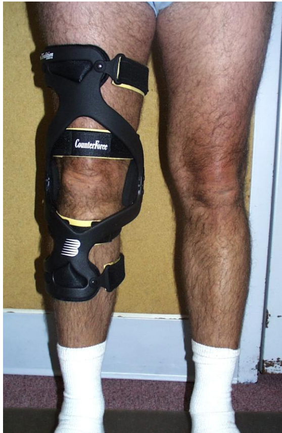
Fig 8. The double upright Breg counterforce OA brace.

My preference has always been the double upright type of brace, but this is just based on intuition, not science!